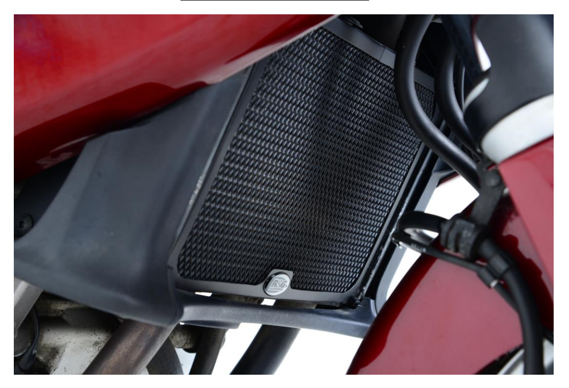
In This Kit There Should Be 1x Radiator Guard (RAD0157BK) 4x Cable Ties 2x 100mm Lengths of self-adhesive Foam