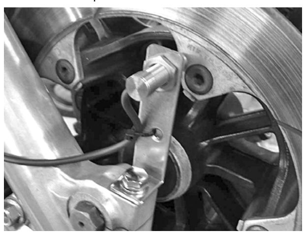
at front axle pinch bolt