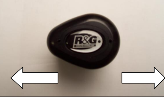
REAR OF BIKE FRONT OF BIKE PICTURE 'C'